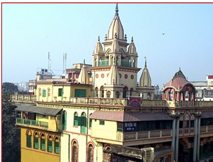
Head Office of Gaudiya Mission

Srimad Bhakti Vinode Thakura (1838–1914), the preceptor of modern day Gaudiya Vaishnavism, rejuvenated Visva Vaishnava Rajsabha to spread the movement of preaching the tenets of Vaisnavism in an effective manner and named it as Namhatta .