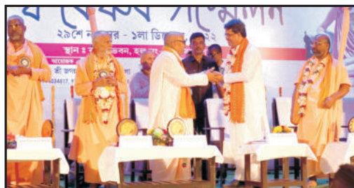
Prof. Dr. Manik Saha, Hon'ble Chief Minister of Tripura at Rabindra Bhawan, Agartala on 30th November, 2022.