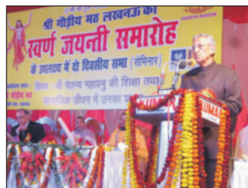
Sri Banwari Lal Joshi, The Governor of U.P. at Lucknow Seminar, 2013.