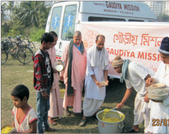
Food distribution among the people affected by fire incident at Kalikapur.