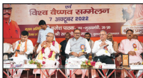
Sri Brajesh Pathak, Hon'ble Deputy Chief Minister of Uttar Pradesh at Srirup Gaudiya Math, Prayagraj on 7th October, 2022.