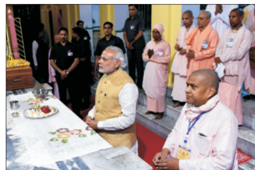
Inaugural function of the centenary celebration of Sri Gaudiya Math and Mission at Sri Gaudiya Math, Bagbazar, Kolkata on 21 Feb., 2016.