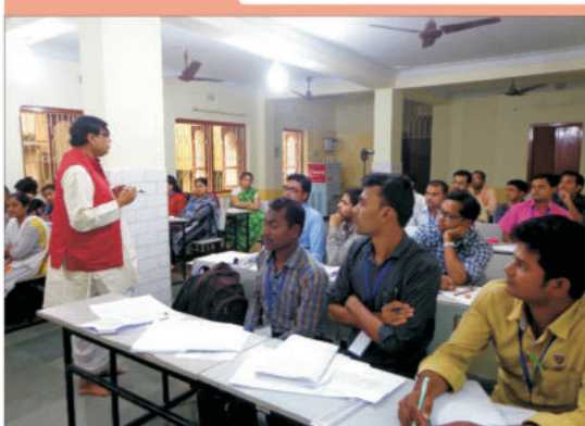
Class on Basic Level National Workshop