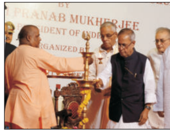
Sri Pranab Mukherjee, The President of India in Foundation Stone Laying Ceremony of World's First Sri Chaitanya Mahaprabhu Museum at Gaudiya Mission, Bagbazar, Kolkata, 16 Sep., 2013