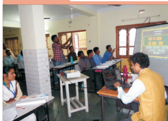
Basic Level National Workshop