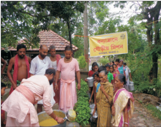
Distribution of food among flood affected people at Amta, Howrah.