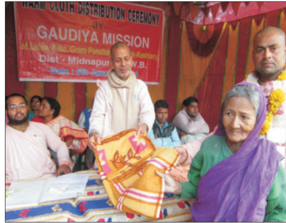
Distribution of blanket among poor tribal people at Keshiyari, Paschim Medinipur.