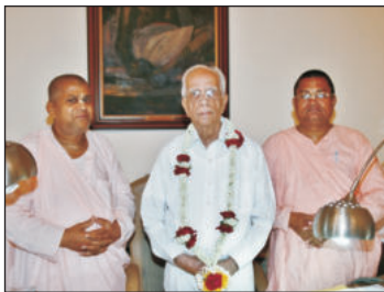
Sri Keshari Nath Tripathi, The Governor of West Bengal, at Rajbhawan, Kolkata, 2016.