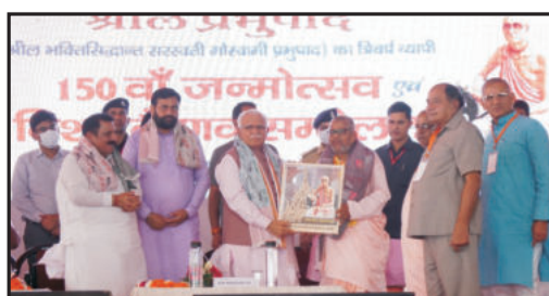
Sri Manohar Lal Khattar, Hon'ble Chief Minister of Haryana at Sri Vyas Gaudiya Math, Kurukshetra on 26th August, 2022.