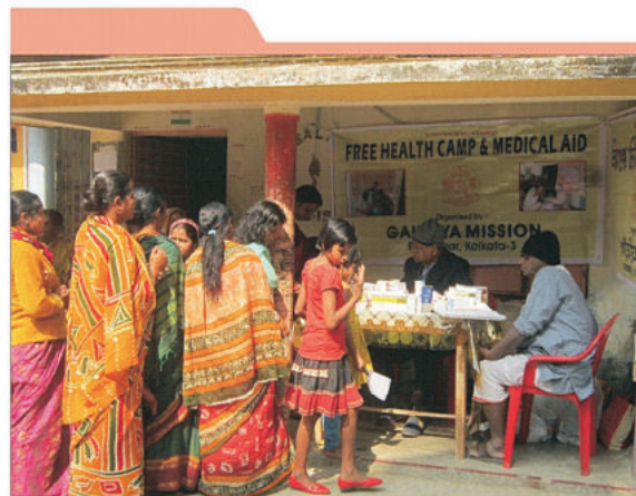
Gocharan, South 24 Parganas