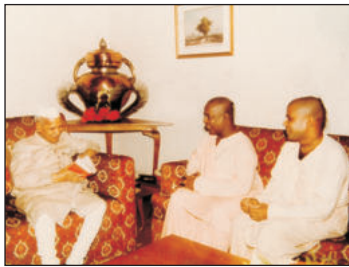
Presenting Srimad Bhagavat Gita to Shri Shankar Dayal Sharma, Hon'ble President of India at Kolkata, 1994.