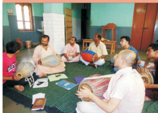
Class on Mridanga (Srikhol)