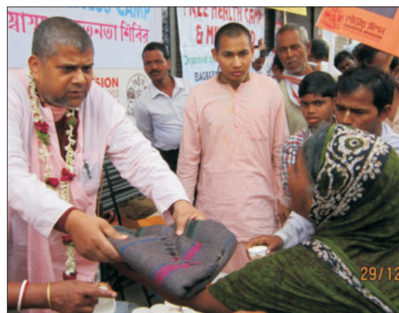
Distribution of blanket among poor families at Sangrampur Kolkata.