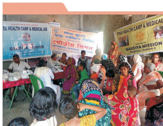
Sri Krishnanagar Gram, Jaynagar, 24 Parganas (N)