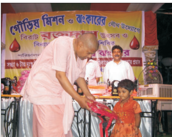
Distribution of school bags among children belonging to poor families.