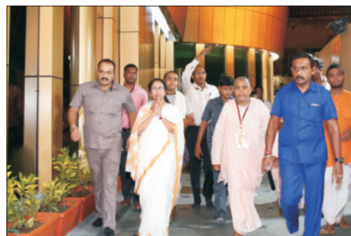
Smt. Mamata Banerjee, Hon'ble Chief Minister of West Bengal, In the Occasion of Inauguration of Sri Chaitanya Mahaprabhu Museum, at Sri Gaudiya Math, Bagbazar, Kolkata on 13th August, 2019.