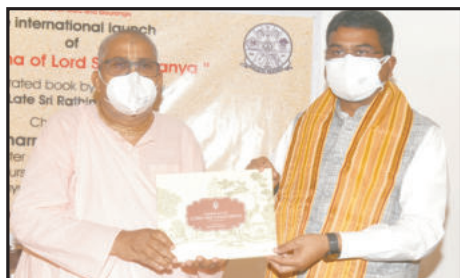
Sri Dharmendra Pradhan, Hon'ble Cabinet Minister of India at Bagbazar, Kolkata on 22nd April 2021.