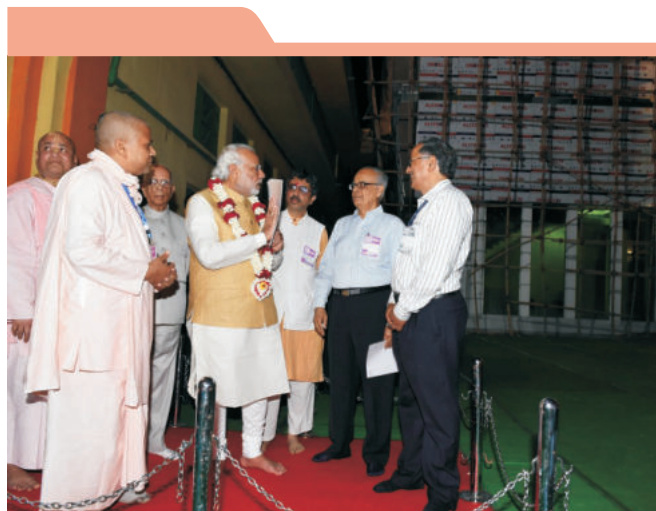
Visited by : Sri Narendra Modi The Prime Minister of India on 21st February 2016