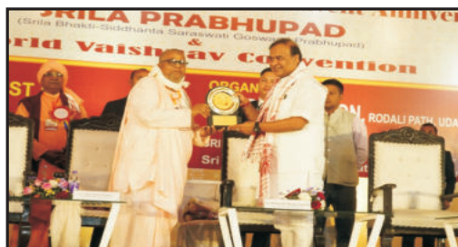
Dr. Himanta Biswa Sarma, Hon'ble Chief Minister of Assam at Sonaram High School Ground, Guwahati on 7th December, 2022.