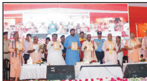
Sri Bandaru Dathatreya, Hon'ble Governor of Haryana at Sri Vyas Gaudiya Math, Kurukshetra on 25th August, 2022.