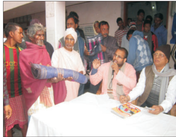
Distribution of blanket among poor tribal people at Amlajora, Bardhaman.