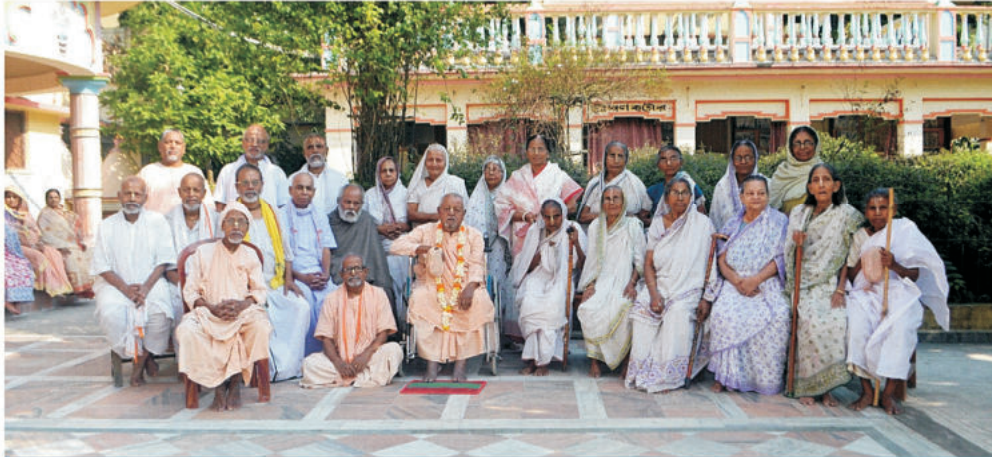
Swarupganj, Nadia, West Bengal