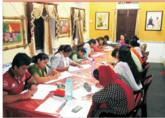
Workshop on manuscripts