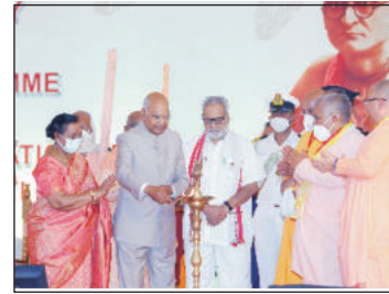
Sri Ram Nath Kovind, Hon'ble President of India at Puri on 20th February 2022