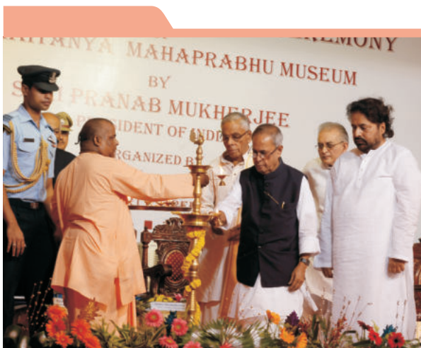
Foundation stone Laid by : Late Pranab Mukherjee The Former President of India on 16th September 2013