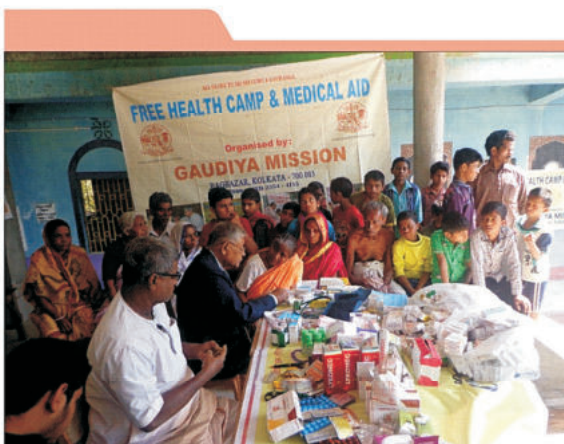
Baruipur, Dhapdhabi, 24Pgs (N), W.B.