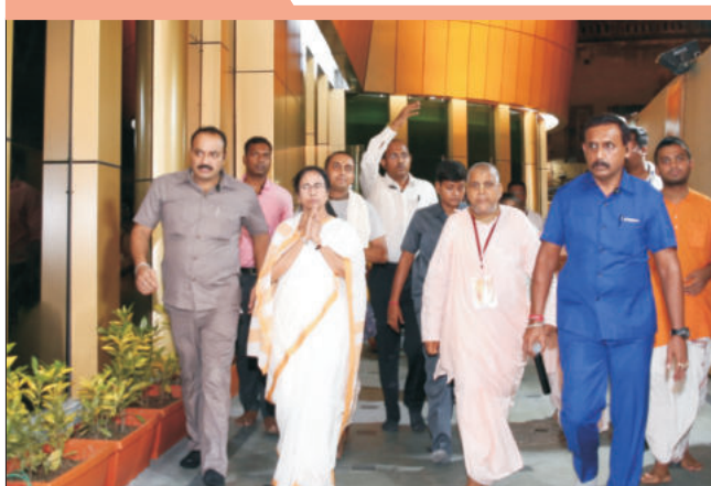
Inaugurated by : Smt. Mamata Banerjee The Chief Minister of West Bengal on 13th August, 2019