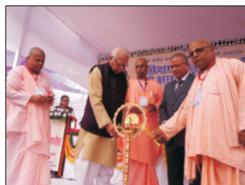
Sri Ram Naik, Hon'ble Governor of UP at Allahabad, 15th November, 2016